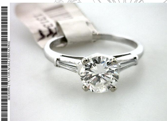
Images of the gemstone or jewelry piece(s) should not be taken as an actual representation of the color, clarity, or brilliance. It should only provide an identification of shape, cut, and/or relative size and may only be an approximate representation to the item in reality. The photo(s) may also be reduced or enlarged in size.