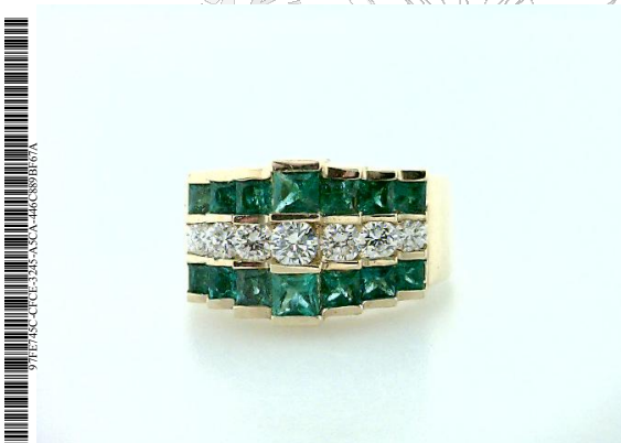
Images of the gemstone or jewelry piece(s) should not be taken as an actual representation of the color, clarity, or brilliance. It should only provide an identification of shape, cut, and/or relative size and may only be an approximate representation to the item in reality. The photo(s) may also be reduced or enlarged in size.

▶ Comments: Value Based on Full Retail MSRP, Graded As Mounting Permits, Natural Emeralds Are Enhanced As Part Of Their Normal Processing