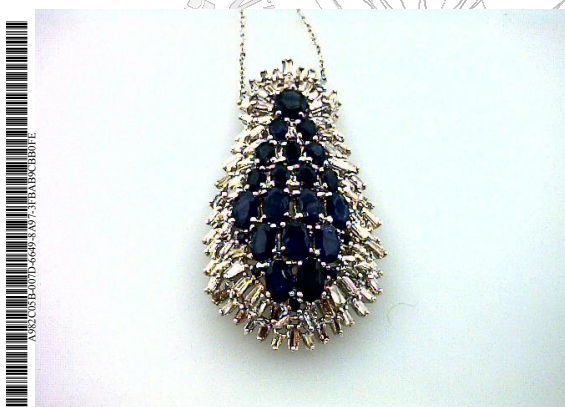
Images of the gemstone or jewelry piece(s) should not be taken as an actual representation of the color, clarity, or brilliance. It should only provide an identification of shape, cut, and/or relative size and may only be an approximate representation to the item in reality. The photo(s) may also be reduced or enlarged in size.

Value Based on Full Retail MSRP, Graded As Mounting Permits