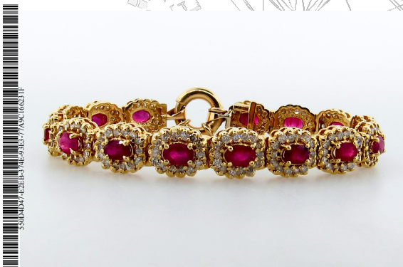
Images of the gemstone or jewelry piece(s) should not be taken as an actual representation of the color, clarity, or brilliance. It should only provide an identification of shape, cut, and/or relative size and may only be an approximate representation to the item in reality. The photo(s) may also be reduced or enlarged in size.

▶ Comments: Value Based on Full Retail MSRP, Graded As Mounting Permits